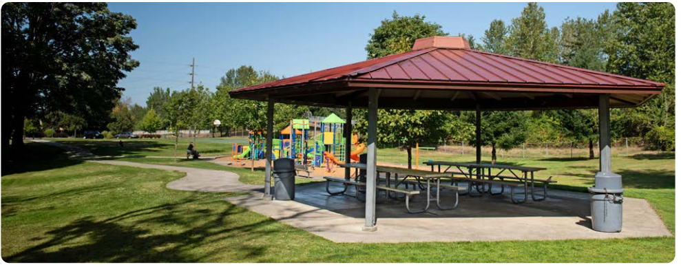
Thomas Teasdale Park Shelter