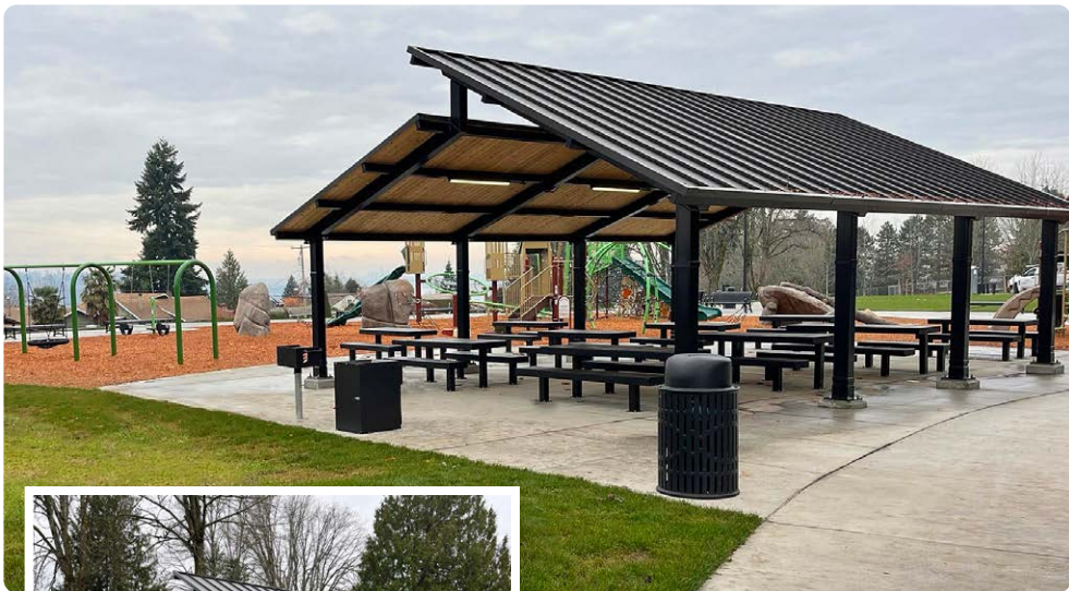
Philip Arnold Park Shelters