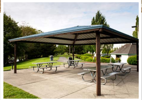
Cedar River Trail Park Shelter

Great for parties, birthdays, reunions, or just getting out and enjoying your community!