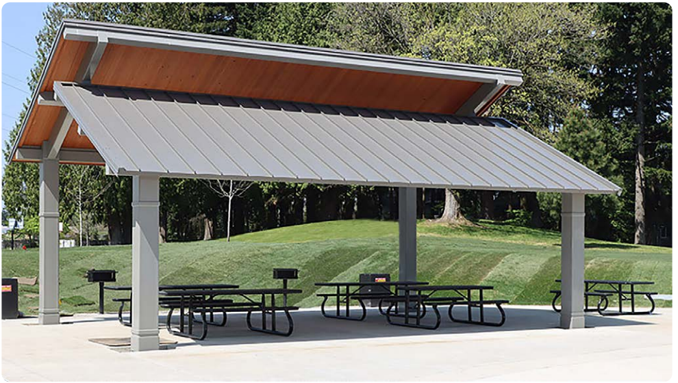
Kiwanis Park Shelter