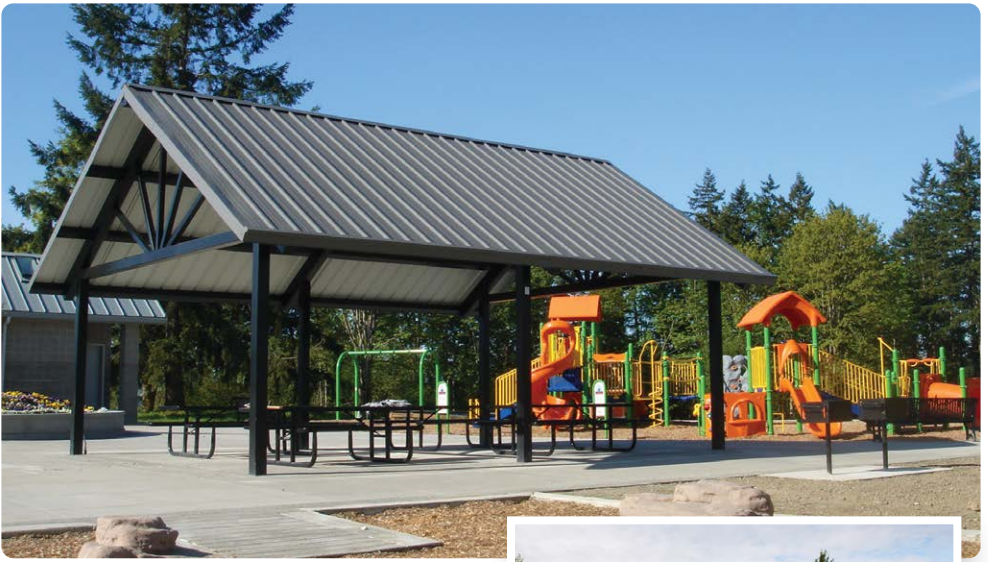
Heritage Park Shelter